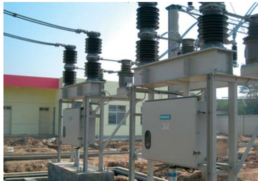
3AF05 installed in traction substation in China

And of the basic 3-pole type (3AF01) of this outdoor vacuum circuit-breaker more than 2,000 units are in service till now.