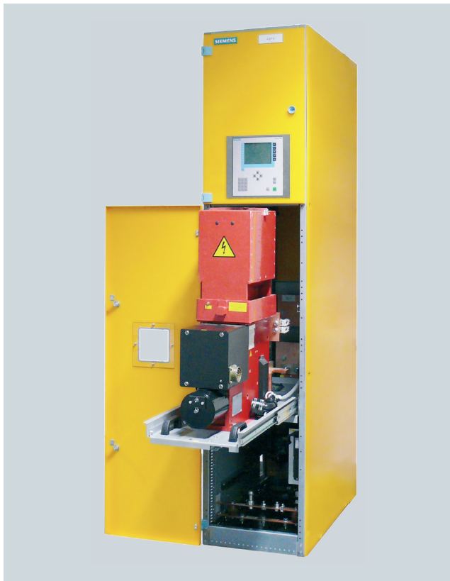
Section feeder panel, footprint 0.45 m 2

* type with rated short-circuit current 50 kA