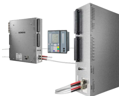
SIPROTEC 5 Process bus solution

Siemens offers new Merging Unit SIPROTEC 6MU805 for conventional instrument transformers. This device allows conversion of current substations to process bus substations without change in the primary equipment. The advantages of process bus can be used, but also a mixed configuration of process bus / non-process bus is possible.