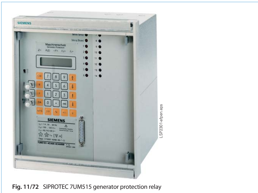
Fig. 11/72 SIPROTEC 7UM515 generator protection relay