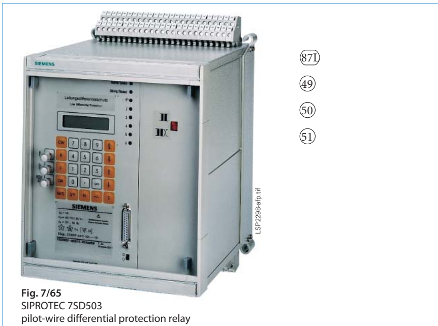
Fig. 7/65 SIPROTEC 7SD503 pilot-wire differential protection relay