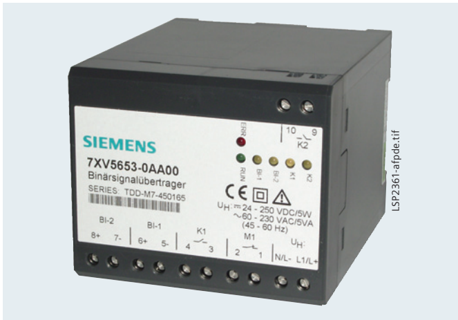
Fig. 13/59 Binary transducer