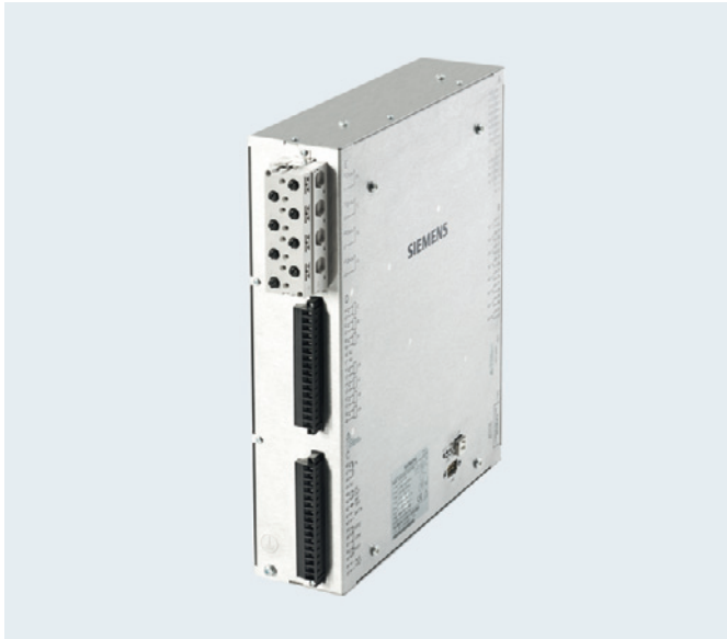
Fig. 13/116 SNTP Master/Server 7SC80