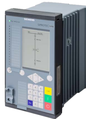
Transformer differential protection SIPROTEC 7UT82 (1/3 x 19")