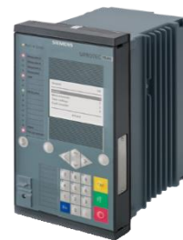
SIPROTEC 5 multifunctional protection device

SIPROTEC 5 devices meet the requirements of the low-voltage directive 2014/35/EU. In accordance with European standard EN 60255-27:2014 (Measuring Relays and Protection Equipment: Product Safety Requirements), voltage measurement inputs have a maximum insulation voltage rating of 300 VAC. The measuring voltage of 400 VAC must not be directly connected to SIPROTEC 5 devices. For low-voltage use, adaptation of the measuring voltage is carried out by using upstream voltage dividers and setting the device parameters.