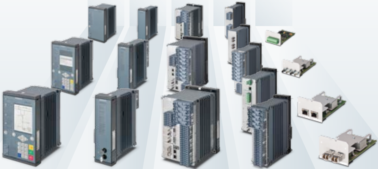
On-site operation panels for base modules