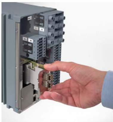
Exchangeable plug-in modules

Line sensors detect arcs along the whole sensor length. They are available from 5 m to 40 m. Line sensors are connected through a supply line to the arc protection module. The supply lines are available from 3 m to 10 m.