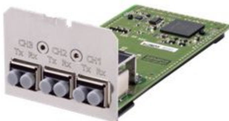
Arc protection module for SIPROTEC 5 devices