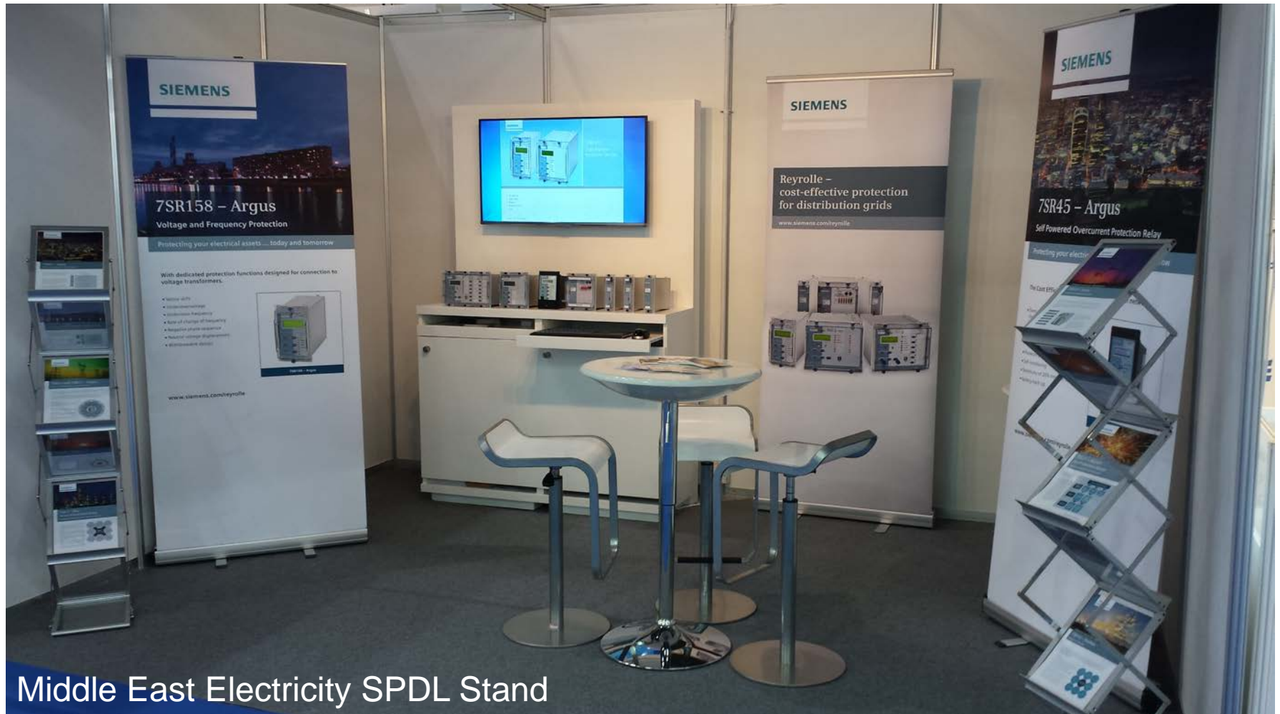
Middle East Electricity SPDL Stand