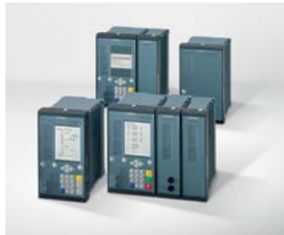
SIPROTEC protection system

Our devices offer functions that previously required entire control panels in some cases. This means that you'll benefit from minimal space requirements, less wiring, and lower cabling costs. And you'll avoid the risk of electromagnetic interference thanks to the use of optical fiber.