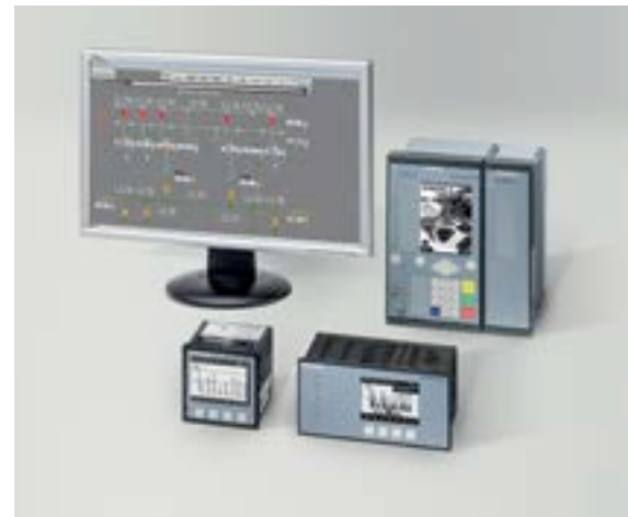
SICAM power quality and measurement

Retrofitting is more than just swapping equipment: It involves measuring, recording, analyzing, and improving, and this continuous loop of actions improves your power quality and avoids unnecessary costs. Our retrofitting uses Class A measuring equipment and guarantees comparable measurements using an established measurement procedure in compliance with the IEC 61000-4-30 standard. With these characteristics, the SICAM Power Quality devices are also perfectly suited to perform court-acceptable power quality measurements.