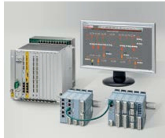
SICAM substation automation

No matter how open your substation automation needs to be for connected devices, it must be just as tightly closed to unauthorized access from the outside. Just as we do with all other retrofits, we realize this by meeting the latest cybersecurity standards.