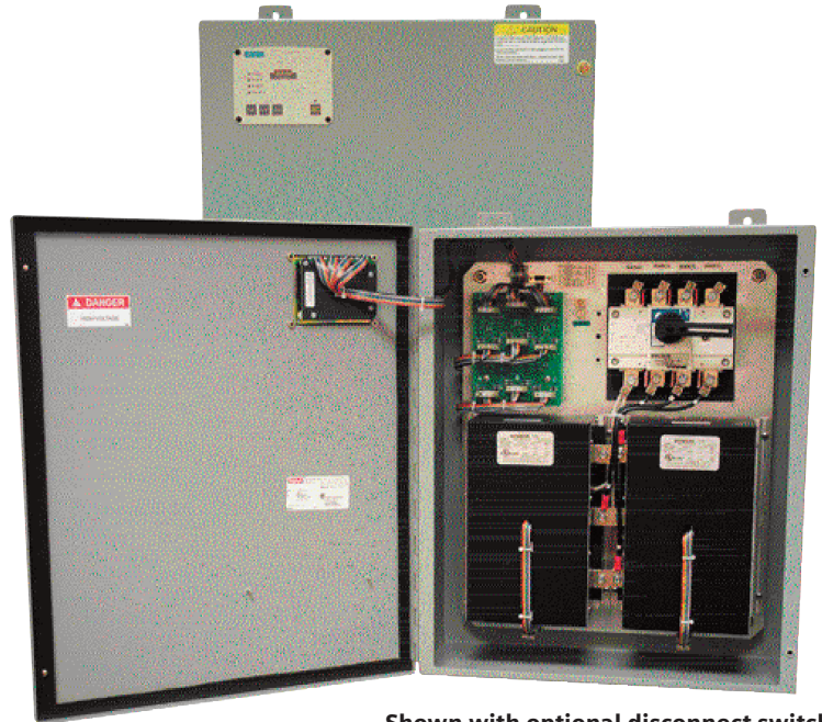
Shown with optional disconnect switch