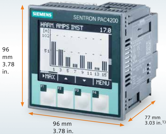
1) 99mm, 3.90 in., with expansion module.

residential tenant space. Integrate the PAC4200 with existing energy management systems and RTUs. Reduce energy consumption by eliminating previously uncontrolled expenses.