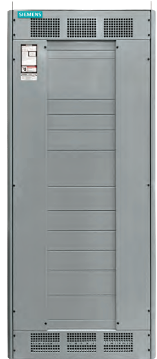
SBEDEF200TNE SBCDEF200TNE 2000A Distribution Section