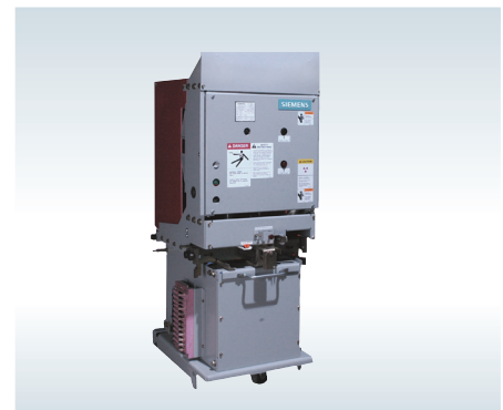
Siemens HVR (replacement for ITE HV)