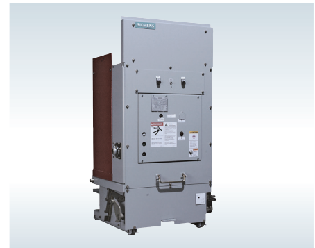
Siemens HKR (replacement for ITE HK)