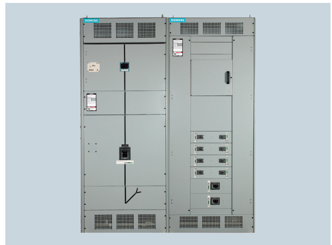
Figure 1. Switchboard lineup