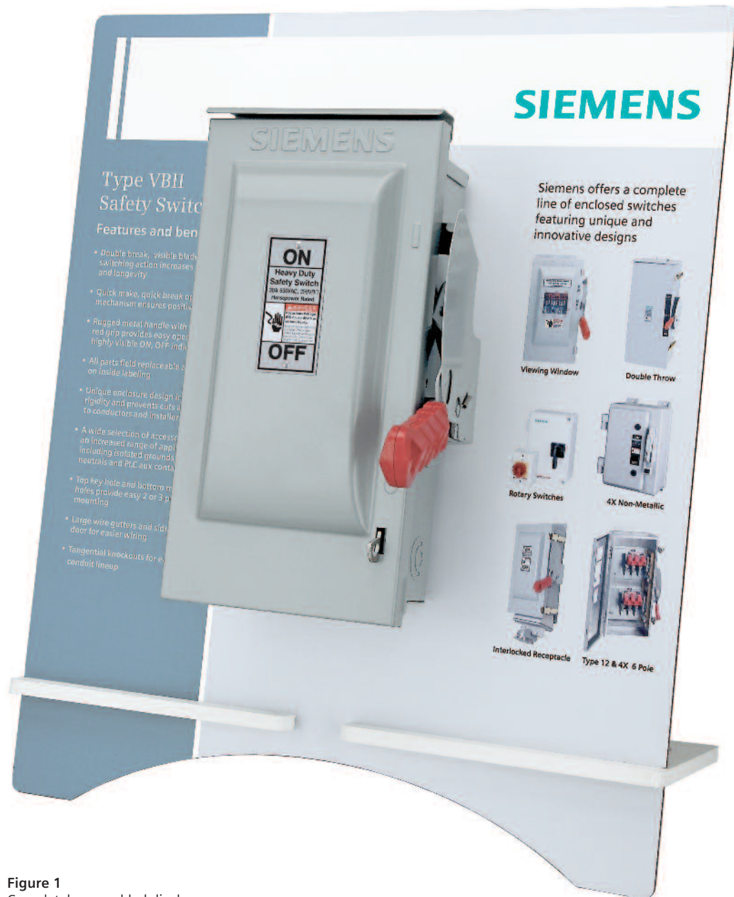
Figure 1 Completely assembled display