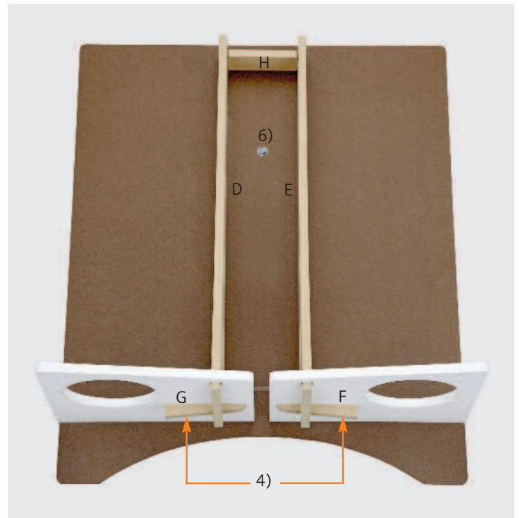
Figure 4 Bottom view

Siemens Industry, Inc. Building Technologies Division 5400 Triangle Parkway Norcross, GA 30092 1-800-964-4114