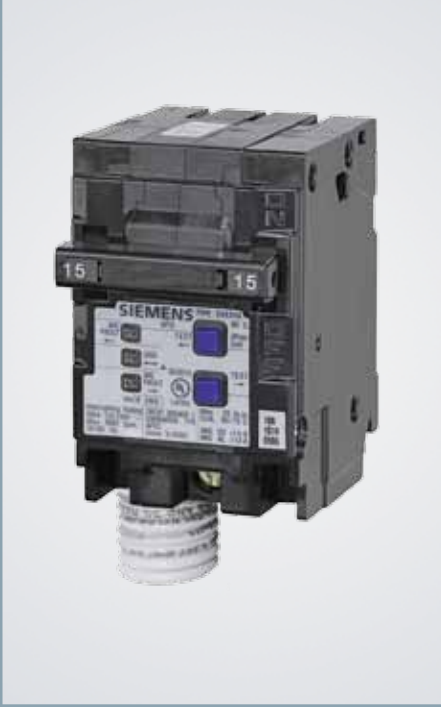
2-pole Combination Type AFCI