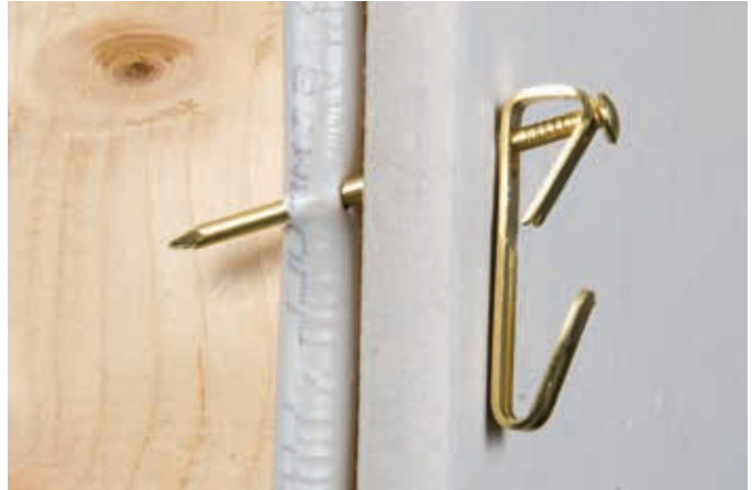
Photo 2: Example of line-to-ground arc fault (nail puncturing NM-B wire).

A line-to-ground arc can occur from an event as simple as hanging a picture. Very few people know what is behind the drywall when they drive a nail. The wiring in most homes, typically NM-B wire, runs behind this drywall. The nail driven to hang a picture can easily penetrate the insulation of NM-B wire. NM-B wire typically includes a bare ground wire positioned between individually insulated hot and neutral conductors.