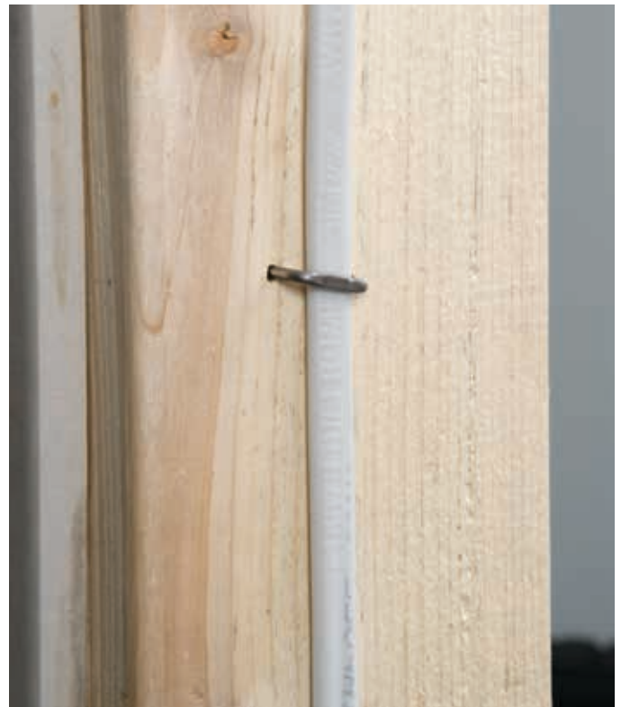
Photo 5: Example of potential line-to-ground arc fault (wire stapled too tight).

occur often in older electrical systems, new electrical systems also can be just as susceptible to certain types of arc faults. Arc fault scenarios initiated by a nail driven into the wall that accidentally nicks an electrical wire, wire damage during installation or due to abuse, defective or misapplied equipment, moisture or contaminants introduced between conductors of different voltages, loose or improper connections, even connecting an aging appliance with a concealed internal arc fault to a new electrical system – any of these situations and many more can cause arc fault induced fires in new construction. As much as we might like to think of new construction as safe, the simple fact is that arc faults do not discriminate between new and existing construction. Most of the reasons commonly provided for electrical fires – overloading of circuits, frayed or worn wiring, dust-covered televisions, and the like – are contributors, not causes. These conditions do not themselves produce enough heat to spark a fire, but they can certainly contribute to arcing. When added to these common conditions, arcing creates spectacular amounts of heat – enough heat to spark a fire many times over.