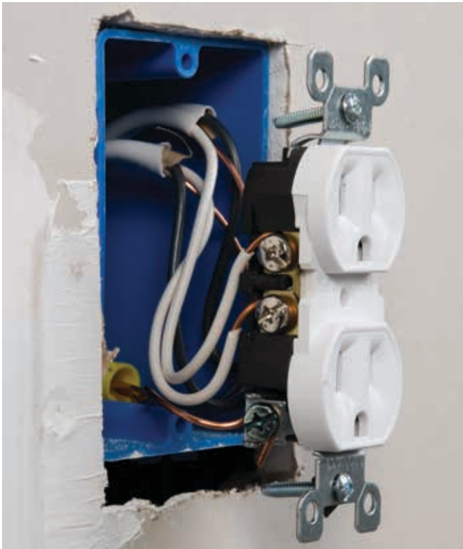
Photo 4: Example of series arc fault (pushing receptacle into work box).

In the example above, pushing the receptacle into the work box created a counterclockwise torque on the screw terminal. This torque could loosen the connection if it were not tightened sufficiently. This loose connection may carry current without arcing after installation. However, intermittent current flow is part of the design of every electrical system and appliance. With very few exceptions, electrical circuits do not run continuously. Loads cycle on and off, either manually or automatically. This intermittent current flow creates heating and cooling cycles at the screw terminal electrical connection. This cycling can cause a thin oxidation layer to form on the connection surfaces. This oxidation layer acts as an insulator. However, the typical 120VAC line voltage is enough to exceed the insulating capacity of the oxide layer. When the voltage exceeds the insulating value of the oxidation layer, electrons jump the insulating gap, allowing current flow in the form of an arc fault. The increased heat from arc formation further accelerates the formation of a carbonized path.