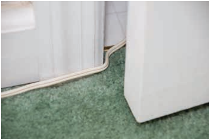
Photo 1: Example of line-to-neutral arc fault (door pinching power cord).

A damaged power supply cord can be an example of a line-to-neutral arc fault. Power supply cords can experience repetitive flexing that, over time, may damage the insulation and/or conductors inside. This flexing may be caused by repetitive use – plugging and unplugging a hair dryer day after day or wrapping a cord around a toaster for storage, for example – or from a door or other weighty obstruction that continually pinches the cord.