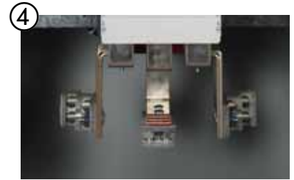
4 Standard mechanical lugs suitable for use with Type W welding cable as a secondary method of connection