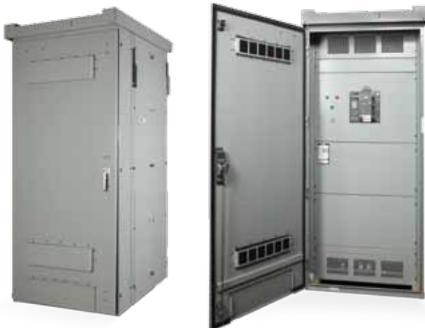
Gen Ready Switchboard in NEMA 3R Enclosure

The most common application of these switchboards are retail stores with perishable items, nursing homes and hospitals. However, these types of switchboards should be applied in any application that is sensitive to power outages.