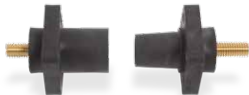
4/0 Crouse-Hinds quick connect Cam-Lok