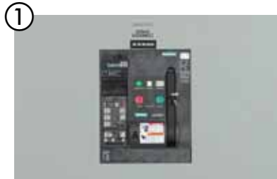
1 Main generator breaker key interlocked with normal main breaker (UL489 2000A WL pictured)