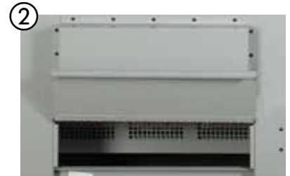
2 Hinged NEMA 3R door to maintain NEMA 3R rating with cables connected