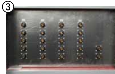
3 2000A example of Crouse-Hinds Cam-Loks for a three phase four wire system with ground connections