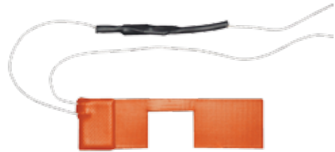
Crankcase warmer Catalog numbers 5864, 5863