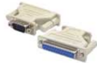
Adapter needed for 25 Pin cable