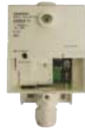
5WG1 254-3EY01-Z-A203 Outdoor ambient light level sensor