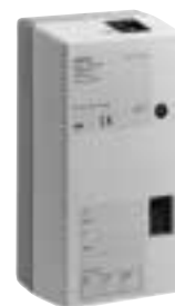
5WG1 146-3AB01-Z-A251 Web access operation and control