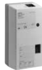
5WG1 146-3AB01-Z-A251 Web access operation and control