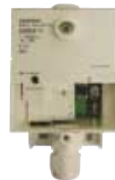
5WG1 254-3EY01-Z-A203 Outdoor ambient light level sensor