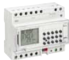
5WG1 373-5EY01-Z-A202 16 channel time clock