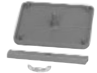
Hub Cover Plate