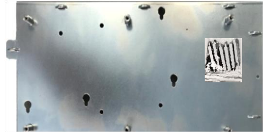
Model FCL-MXLPLATE Mounting Bracket

The placement of the FCL2004 modules on the adapter plate determines its address. The first FCL2004 module is always address 91 and the second (where applicable) module is always address 92.