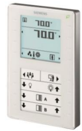
QMX3.P37 Room Sensor/Operator with Display