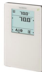
QMX3.P34/P44/P74 Sensor with Full Display