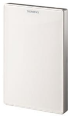
QMX3.P30/P40/P70 Sensing Only