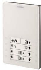
QMX3.P02 Sensor/Room Operator