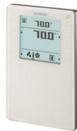
QMX3.P34/P74 Sensor with Full Display