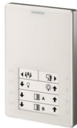
QMX3.P02 Sensor/Room Operator