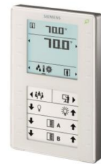
QMX3.P37 Room Sensor/Operator with Display