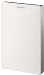
QMX3.P30/P70 Sensing Only