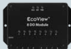
Lighting Control – Typically located in electrical closet

● 8DO Module – Control lighting components through wireless communication with the Touchscreen and wired connection to lighting circuits.