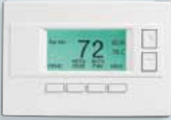
Area 2 Thermostat