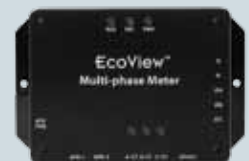
Multi-phase Meter – Typically located in electrical closet

Multi-phase Meter – Allows for real-time tracking of energy consumption.