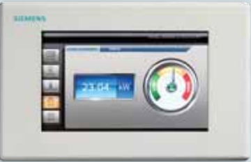
Touchscreen – Typically located in manager’s office

■ Thermostats – Control heating and cooling through wireless communication with the Touchscreen, wired to HVAC units.