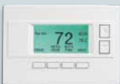
Area 3 Thermostat

● 8DO Module – Control lighting components through wireless communication with the Touchscreen and wired connection to lighting circuits.