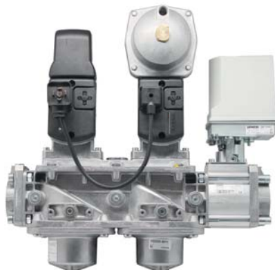
Example: Floating control VKP40/SQN72 mounted to VGD20