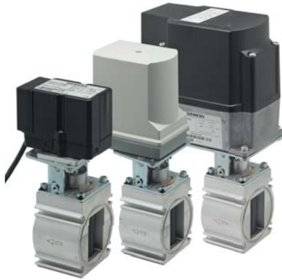
Example: Floating control VKP40 with damper actuators

VKP40 includes a specific coupling which enables to connect SQN actuators with an \varnothing 8mm D-shaft and SQM actuators with a \varnothing 10mm D-shaft.