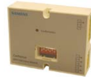
Figure 1 BDS132A