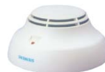
Figure 1 BDS051A

Detector base for SIEMENS Model BDS051A should be connected as shown in Figure 2.