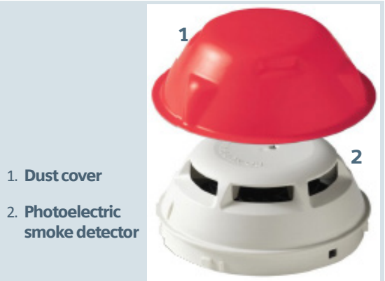
1. Dust cover 2. Photoelectric smoke detector

The smoke chamber is designed to manage light dissipation and extraneous reflections from dust particles or other non-smoke, airborne contaminants in such a way as to maintain stable, consistent detector operation. When smoke enters the detector chamber, light emitted from the IRLED is scattered by the smoke particles, and is received by the photodiode (see: the computer-graphic images at the top of this page).