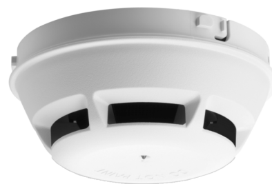
Model OP921 Photoelectric Smoke Detector

Each field-device programmer / test unit operates on AC power or rechargeable batteries, providing flexibility and convenience in the programming / testing of fire-safety equipment from practically any location. Additionally, with the use of a Model DPU unit, there is no longer a cause for concern with any vibration, corrosion and other deteriorating conditions that can accompany the vitality of a mechanical-addressing mechanism.