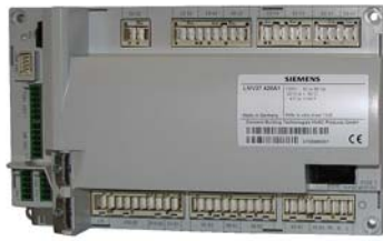
Example: LMV2... / LMV3...