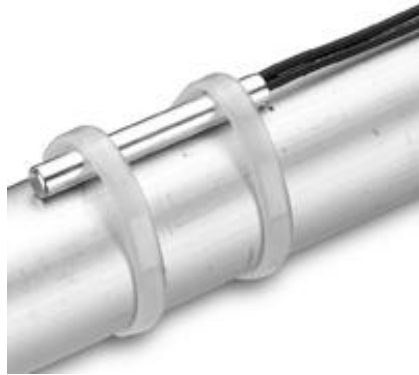
Strap-on Cable Only