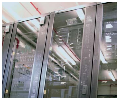
Internet PoP, Hanover, Germany