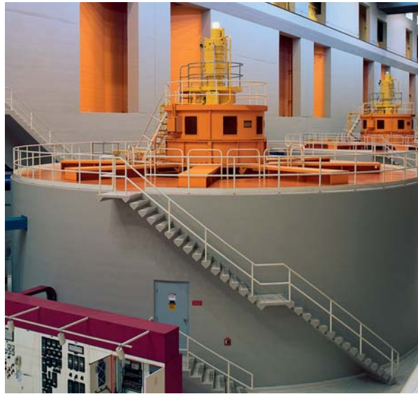
Sinorix extinguishing solutions with natural gases can be tailored to existing building structures and requirements.