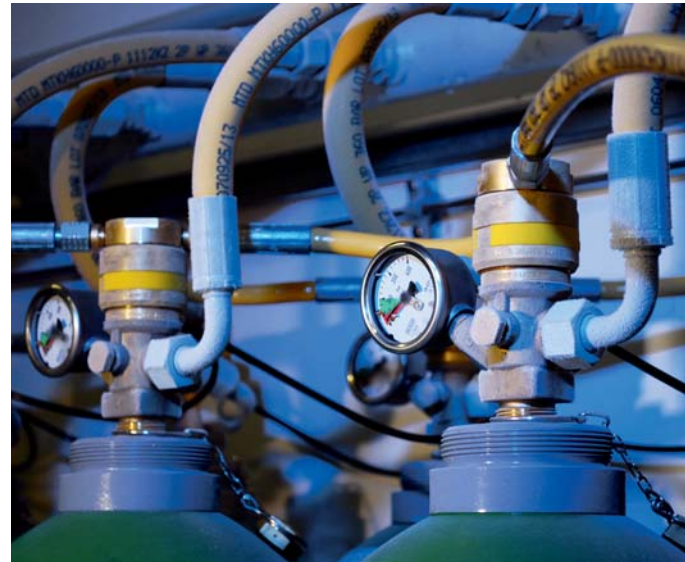
Depending on the application, nitrogen, argon or carbon dioxide is the optimal extinguishing agent.