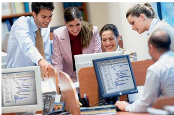
C-LINE fire detectors are suitable for use in office buildings ... in museums ...

Comprehensive fire protection with the latest fire detectors – that's what C-LINE fire detectors from Siemens stand for. However, they offer more than reliable security. C-LINE detectors also convince with a short installation time and minimal operating costs. And this makes them appealing not only to safety managers, but also to investors.