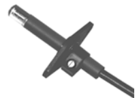
Photo resistive flame detector for use with Siemens burner controls, for the supervision of oil flames in the visible light spectrum. Especially suited for use with burner controls for small capacity burners